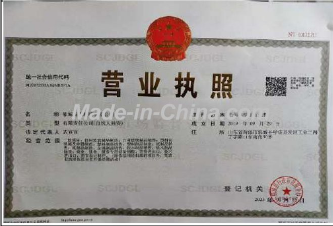
Description: Business License